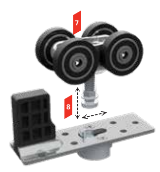
M8 carriage & mounting plate with stop

CarriSnap<sup>™</sup> quick release system allows the door to be removed easily from the track; no need to unscrew anything and lose door height adjustment.